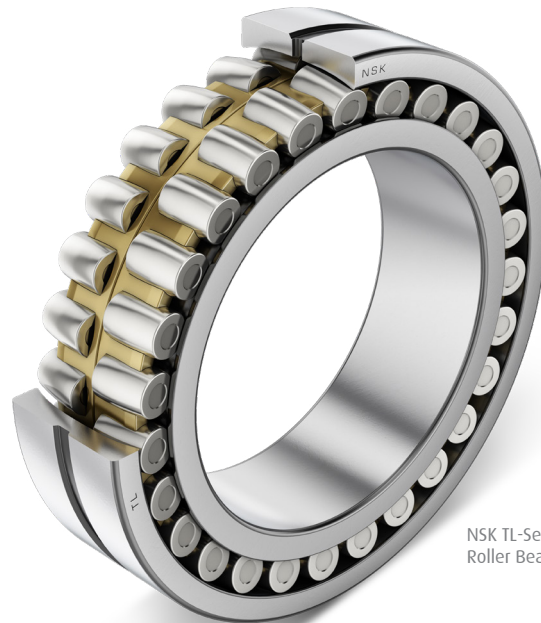
NSK TL-Series Spherical Roller Bearing